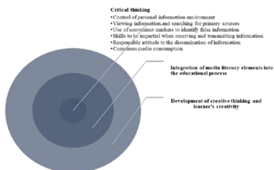
Figure 2. The components of pupils' critical thinking that are envisaged by the curricula of secondary educational institutions